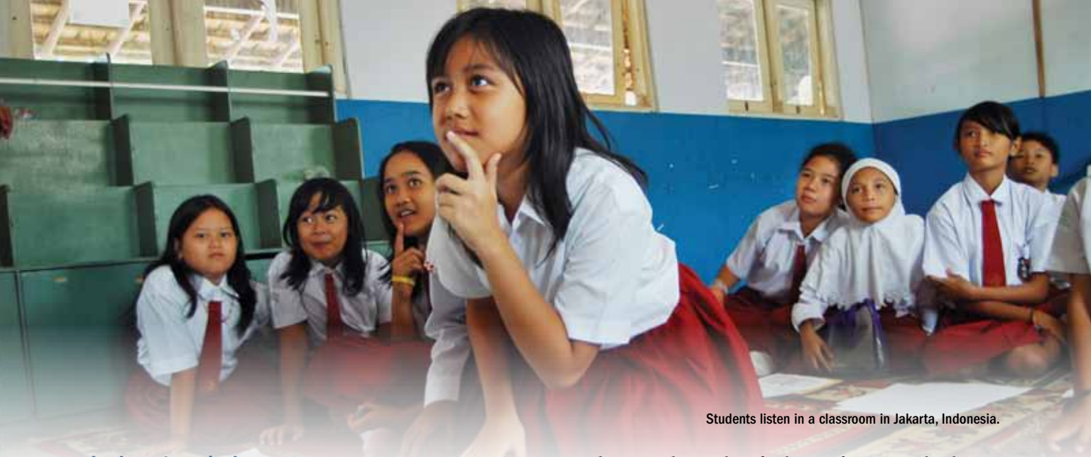
Students listen in a classroom in Jakarta, Indonesia.