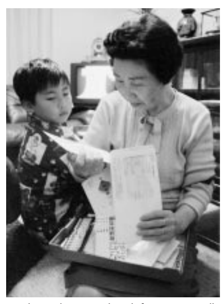
A sharp demographic shift in Japan will have macroeconomic implications for the young and the old.

Where Japan differs from other industrial countries is in degree. The rate of increase of Japan's elderly dependents is much higher than elsewhere. Ten years ago, Japan had the lowest share of elderly dependents among industrial countries; now it has the (Continued on page 343)