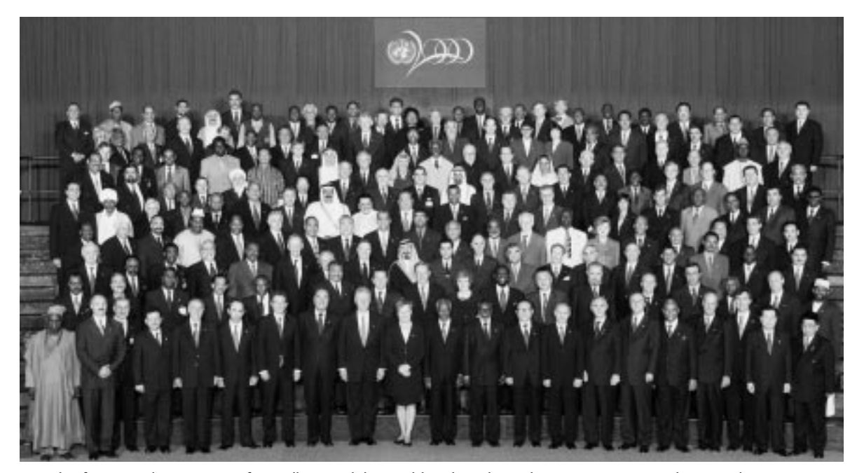
Heads of state and government from all around the world gathered together to participate in the United Nations Millennium Summit in New York.

The IMF Survey (ISSN 0047-083X) is published in English, French, and Spanish by the IMF 23 times a year, plus an annual Supplement on the IMF and an annual index. Opinions and materials in the IMF Survey do not necessarily reflect official views of the IMF. Any maps used are for the convenience of readers, based on National Geographic's Atlas of the World, Sixth Edition; the denominations used and the boundaries shown do not imply any judgment by the IMF on the legal status of any territory or any endorsement or acceptance of such boundaries. Material from the IMF Survey may be reprinted, with due credit given. Address editorial correspondence to Current Publications Division, Room IS7-1100, IMF, Washington, DC 20431 U.S.A. Tel.: (202) 623-8585; or e-mail any comments to imfsurvey@imf.org. The IMF Survey is mailed first class in Canada, Mexico, and the United States, and by airspeed elsewhere. Private firms and individuals are charged $79.00 annually. Apply for subscriptions to Publication Services, Box X2000, IMF, Washington, DC 20431 U.S.A. Tel.: (202) 623-7430. Fax: (202) 623-7201; e-mail: publications@imf.org.