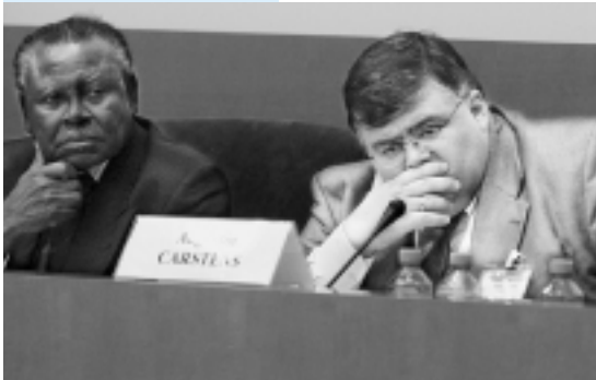
Listening to the proceedings are (left) Joseph Henry Mensah, Member of Parliament from Ghana, and Agustín Carstens, IMF Deputy Managing Director.

Financing was also a key concern, and participants received an update on several major bilateral