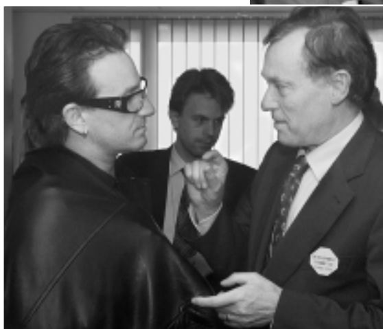
Köhler with Bono during the 2000 Annual Meetings in Prague, Czech Republic.

IMF employs to prevent crises. In his view, the international community should provide "timely and proactive support and help" to countries that have "the right intentions, the right policy in place," but suffer international financial and economic setbacks that are not under their control.