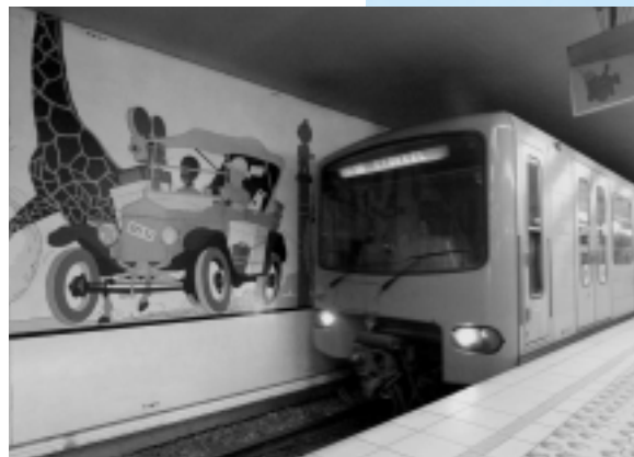
A metro train is arriving at Stockel Station in Brussels. Almost no one pays full fare when using public transportation, thanks to generous fare subsidies.

Looking ahead, Belgium—like most other advanced economies—faces structural pressure to increase health care spending. Quite apart from the effect of population aging, which will have relatively trivial consequences for the budget, the pace of health care spending has exceeded expectations and budgetary norms. In response, the government has raised the growth norm to 4.5 percent a year in real terms for the next four years. While this norm stands a good chance of being adhered to, it accommodates