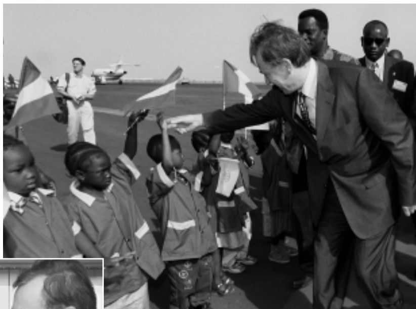
Children welcome Köhler to Bamako, Mali, during his February 2001 visit to sub-Saharan Africa.

those talks, he suggested, will not be affected by the selection of a new managing director. Referring to leaders in the region like President Lula da Silva, he said that they don't need to be lectured about what is right for their people. What they need is "appropriate support at the appropriate time," adding that he favored a rethinking of the instruments that the