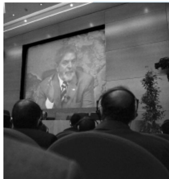
Speaking via direct video link, Brazilian President Luiz Inácio Lula da Silva addresses conference participants.