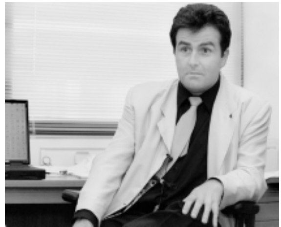
Sala-i-Martin: "Ironically, good government and strong institutions require that the raising of public resources is costly."

The second objection is that the proposal would be doubly wasteful because it would incur two sets of costs—first in distributing oil revenues and then in taxing these revenues to finance government needs. But we would argue that the efficiency costs are eclipsed by the benefits of encouraging public