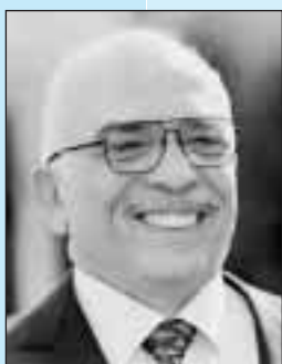
H.M. King Hussein of Jordan

IMF Managing Director Michel Camdessus expressed his formal condolences on the death of the King of Jordan. Following is the text of news brief 99/6, issued on February 7.