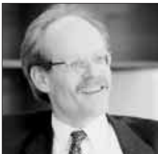
Stefan Ingves, IMF's Monetary and Exchange Affairs Department Director.