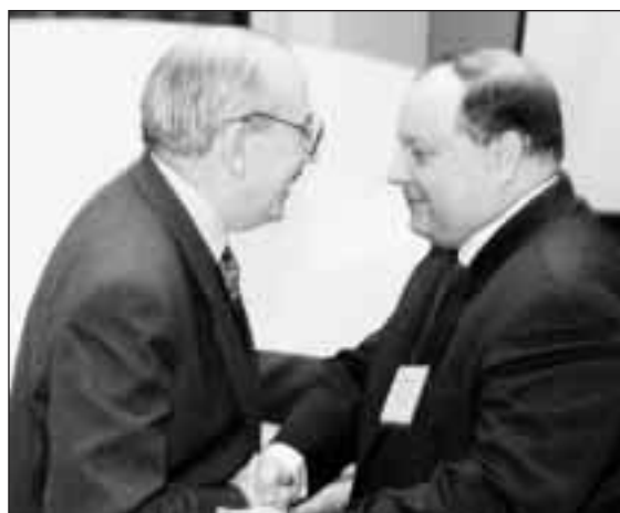
At the opening session, IMF Managing Director Michel Camdessus (left) greets Egor Gaidar, former Prime Minister of Russia.

and time-consuming task of creating a modern, effective state and building institutions supportive of a market-oriented economy. (Please turn to the following page)