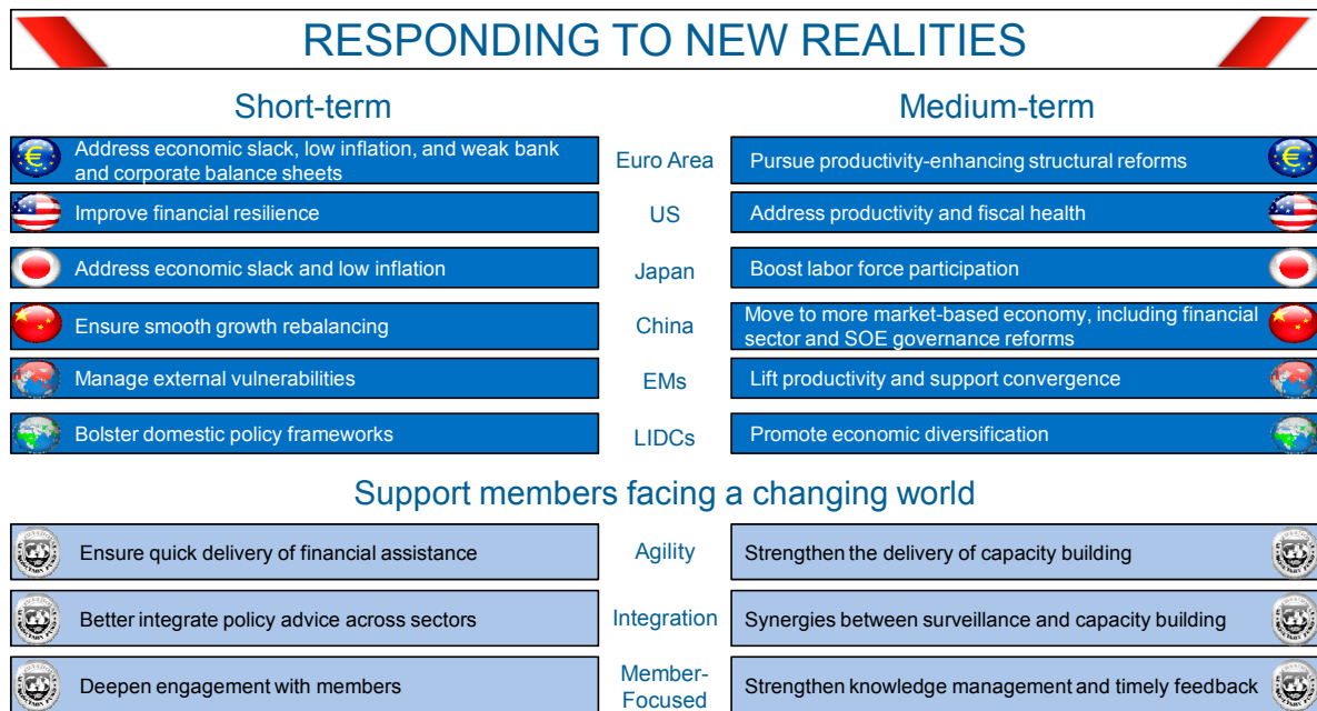
Figure 1. Summary of Policy Priorities Going Forward