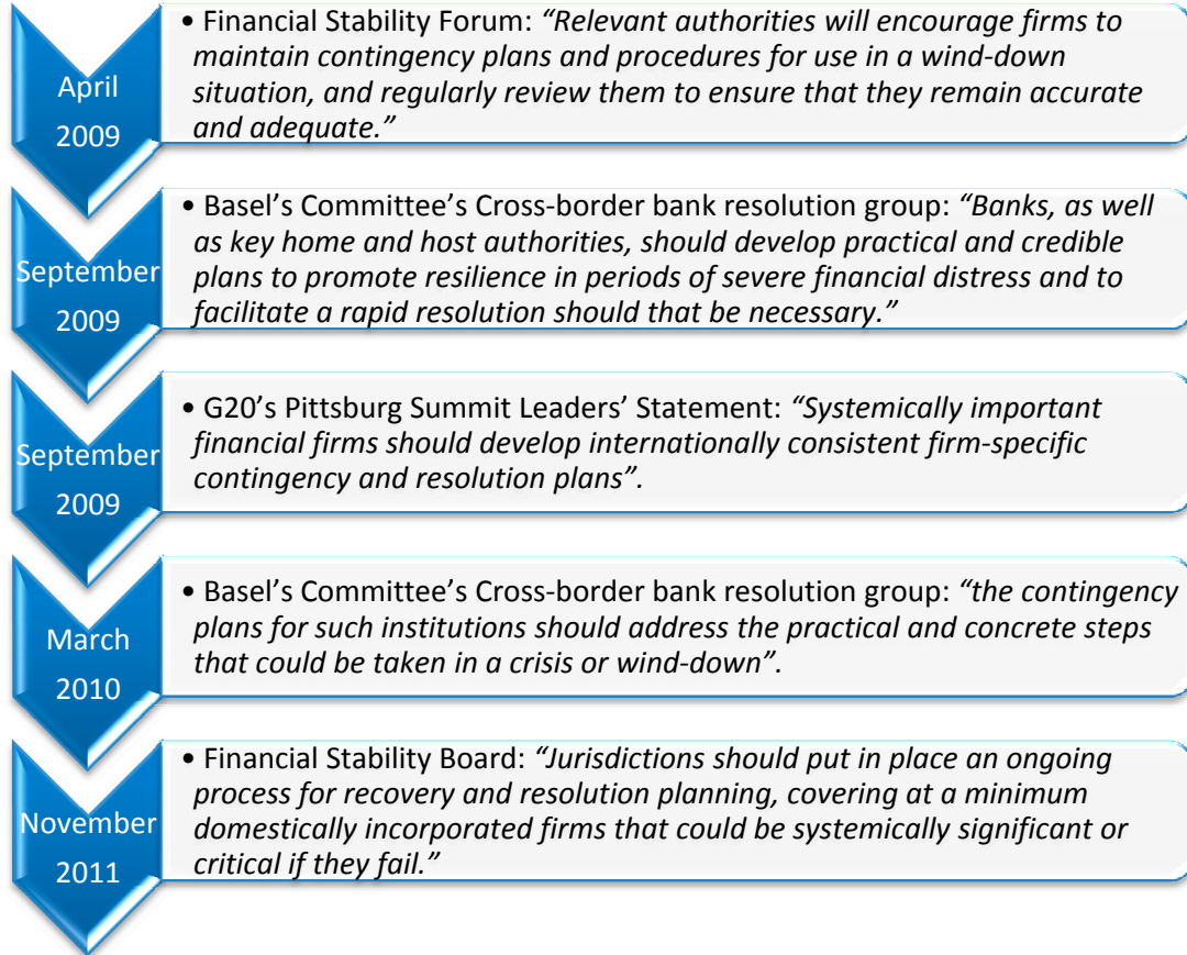
Figure 3. Key Decisions Underpinning Recovery and Resolution Planning

29. The FSB has set out an ambitious timetable for the development of RRP s (Figure 4). For all designated G-SIFIs, RRP are to be finalized by end-2012. The CMGs are then expected to conduct resolvability assessments for all G-SIFIs in the first quarter of 2013 and to develop basic resolution strategies. At the same time, institution-specific cooperation agreements (see paragraph 26 above) are to be developed for all G-SIFIs. The processes for recovery and resolution planning, the conduct of resolvability assessments, and the conclusion of cooperation agreements are iterative and will require further refinement and adjustment over time in light of experience.