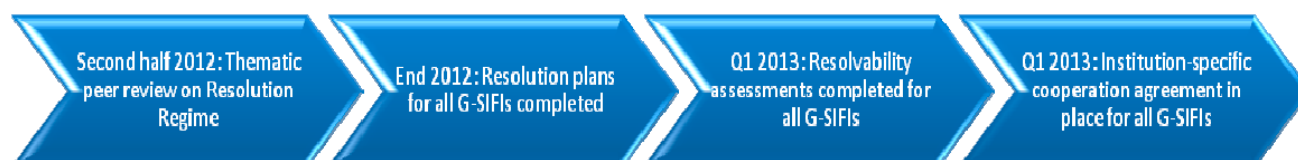
Figure 4. Key RRP Milestones

31. Financial institutions are increasingly using RRP as an instrument to identify and address undue complexities in group structures. Evidence from recent reports from the Financial Sector Assessment Program (FSAP) suggests that institutions that have gone through a detailed RRP process benefit from the opportunity to closely scrutinize their own structure and key processes in order to remove unnecessary complexities and better align the structure with the institution's business model.