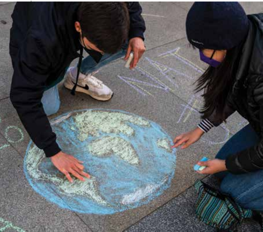
Activists protest from the "Fridays for Future" group.

At the same time, countries face constraints in pursuing climate action because of the impact of the pandemic on their economies and the associated steep increases in public debt. The US and Europe have embraced large-scale policies to subsidize clean energy to reduce climate debt, but this option is not open to developing economies given their lack of fiscal space. That said, both country groups should pay attention to the revenue side, in particular higher taxation of energy, with carbon taxes to reduce climate debt. This would reduce emissions while helping countries fund additional spending. Carbon taxation must be accompanied by complementary fiscal policies to offset the tax's short-term adverse effects on low-income households.