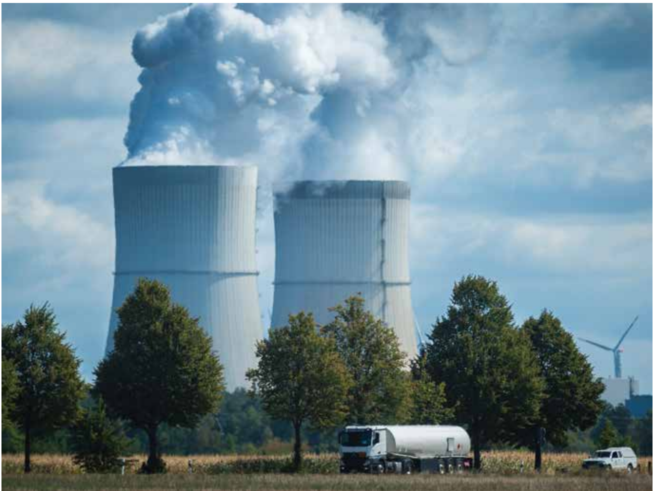
The cooling tower of a lignite-fired power plant

of each country's climate debt reflects both the size of its economy (which is positively correlated with emissions) and how intensively it uses fossil fuels (thus generating emissions) for every dollar of economic output. The composition of energy use (for example, heavy use of coal) has an impact as well. As of 2018, the largest contributors were the United States ($14 trillion), China ($10 trillion), and Russia ($5 trillion). Beginning in 2018, developing economies will account for a larger share of climate debt, given their relatively higher economic growth.