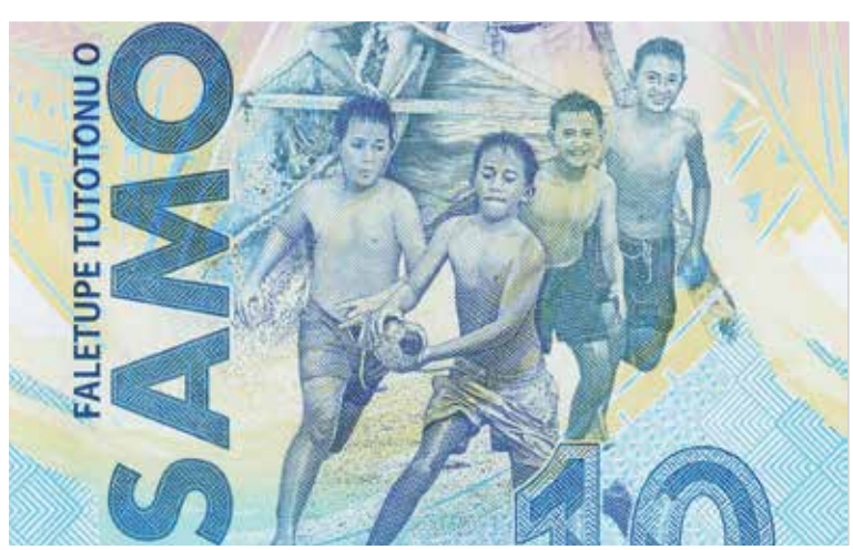
Samoa issued a commemorative $10 tala bill in 2019 to celebrate the Pacific Games, which the country hosted. It is thought to be the world's first carbon-neutral banknote.

“existential threat . . . for all our Pacific family.” In a 2019 speech to the United Nations, he said the crisis is not limited to small island or developing states. “Climate change crosses borders uninvited and does not discriminate by size or economic status,” he said.