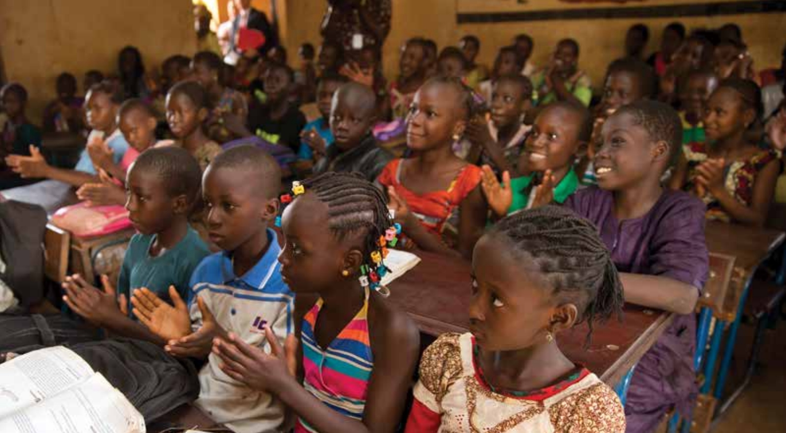
Higher tax revenue can support schools such as this one in Mali.

taxpayer identification numbers and streamlined its process. It also introduced income tax withholding, a measure critical to fostering compliance.